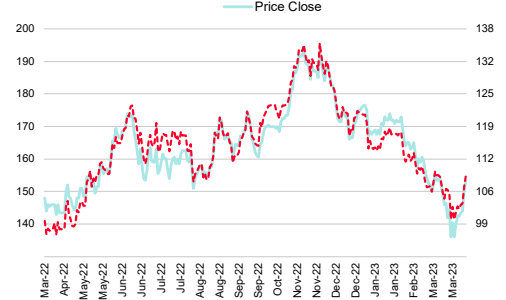
PTT Exploration & Production (PTTEP TB)